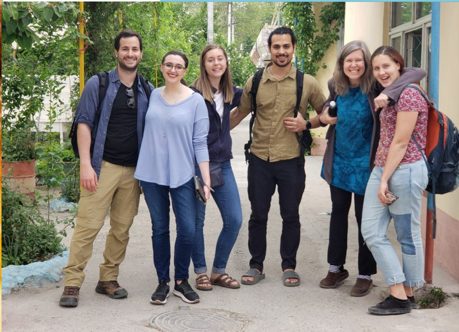
By the end of our Margilon adventure day, Green team members met us for more walking and dinner.