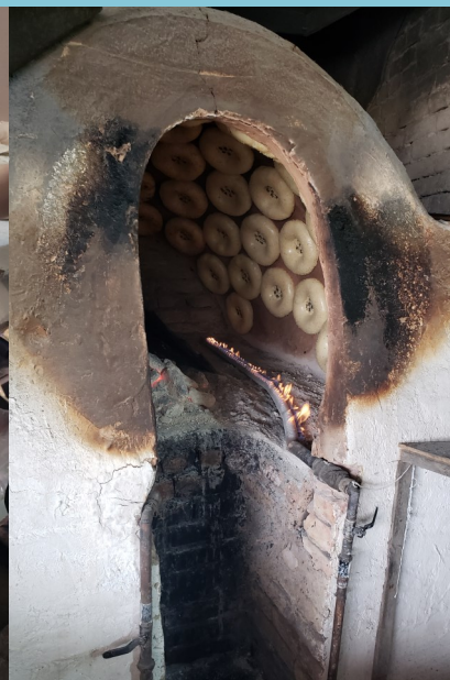
Tandır bread is a staple of Uzbek life. Each area of Uzbekistan does it a little bit differently. It was amazing to watch the bread stick to the walls and ceiling of the hot tandır.