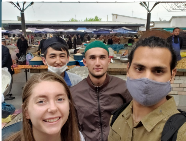
Bozor workers we met in Margilon. We were gifted peanuts and qaymoq.

this time, and enjoyed our time stumbling into and talking with locals. This included a personal tour of tandır bread making as shown below! From this visit, we learned that some of the most fun happens when there is no plan.