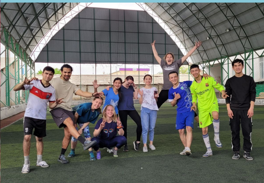
One of the many football games that were played to celebrate.