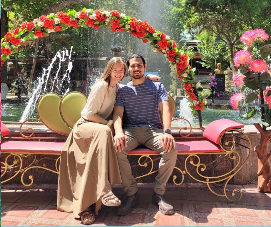
A day in Chust to celebrate our first wedding anniversary. We went to the market with visiting ETAs, ate in the park, and rode carnival rides.

The beginning of May was riddled with celebrations. We celebrated our first wedding anniversary and both of our birthdays. Other teachers visited us in Namangan, we played lots of football, danced, ate cakes, and more.