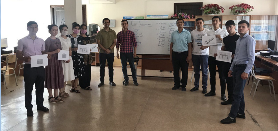
Student presentations for the end of the semester.